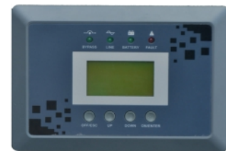
LED+LCD Screen upto 10~60KVA