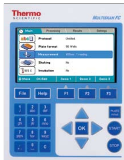
Large color screen and visual internal software

Applications: Immunoassays (ELISA), protein assays, endotoxins, cytotoxicity and proliferation assays, enzyme assays, growth curves